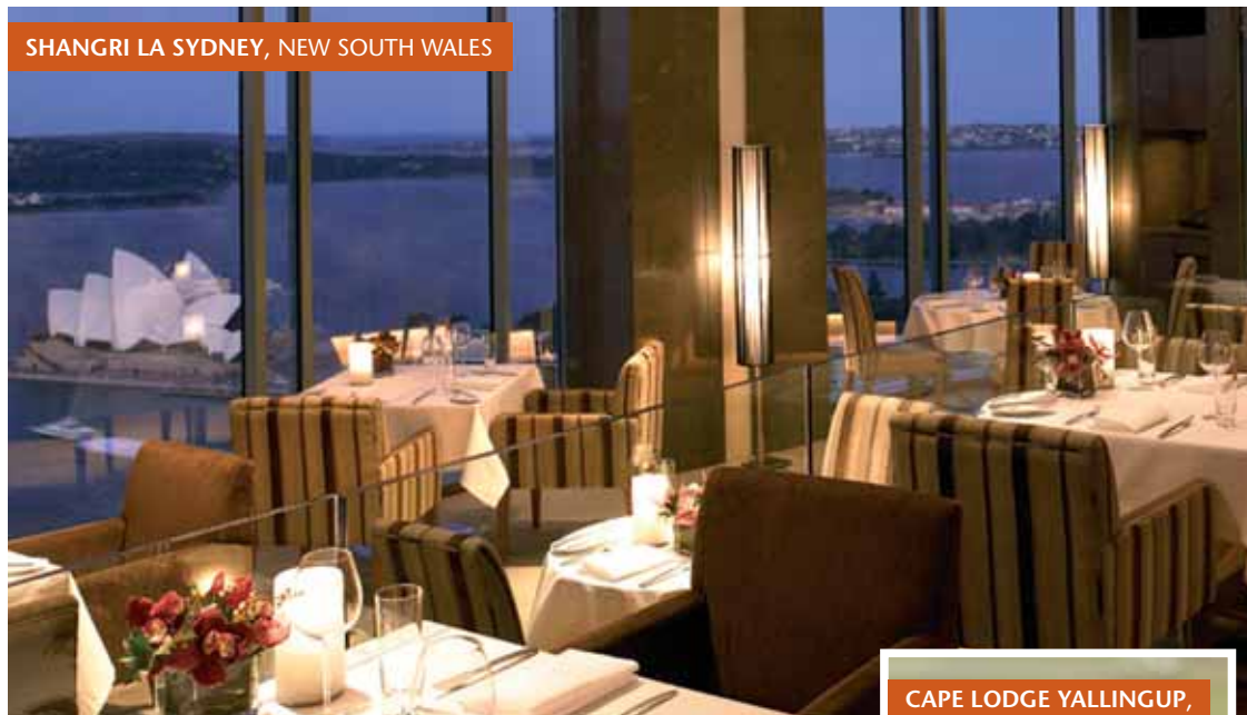
SHANGRI LA SYDNEY, NEW SOUTH WALES

From a beach BBQ to a degustation menu in a 5 star restaurant with outstanding local wines, Australia boasts some of the best gourmet experiences you can get. With well-renowned vineyards the wine scene is fast becoming one of the best in the World.