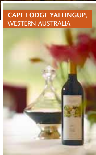
CAPE LODGE YALLINGUP, WESTERN AUSTRALIA

6 Moorooroo Park Jacobs Creek Retreat - For absolutely peace and tranquility in the heart of Barossa Valley Winelands, Jacobs Creek Retreat features just 6 individually appointed suites. The property also boasts a private chef who specialises in creating a tailor made degustation lunch. FROM £107 PER PERSON PER NIGHT.