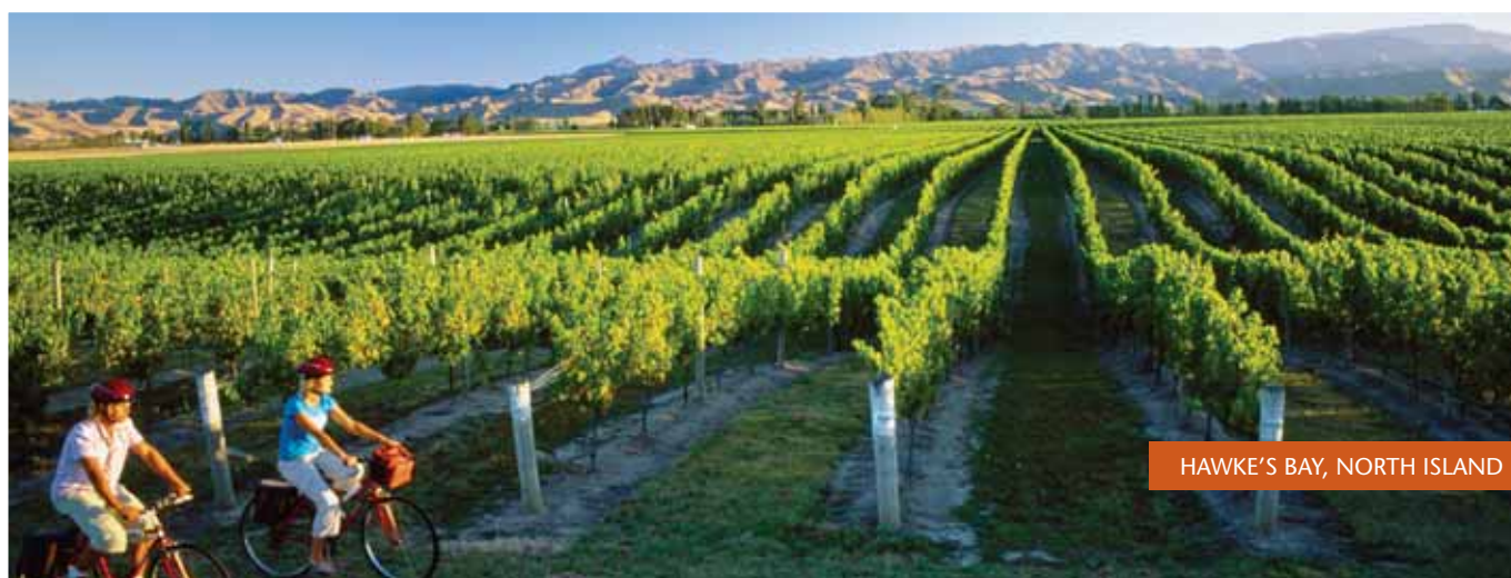
HAWKE'S BAY, NORTH ISLAND

8 On Yer Bike Wine Tour - With routes catering for all levels of fitness, pick up a bicycle, map, and packed lunch and head off to taste wines in the Hawkes Bay wine region.