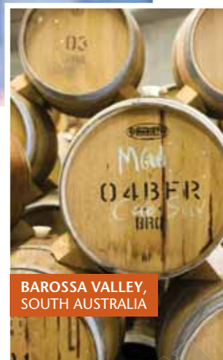
BAROSSA VALLEY, SOUTH AUSTRALIA