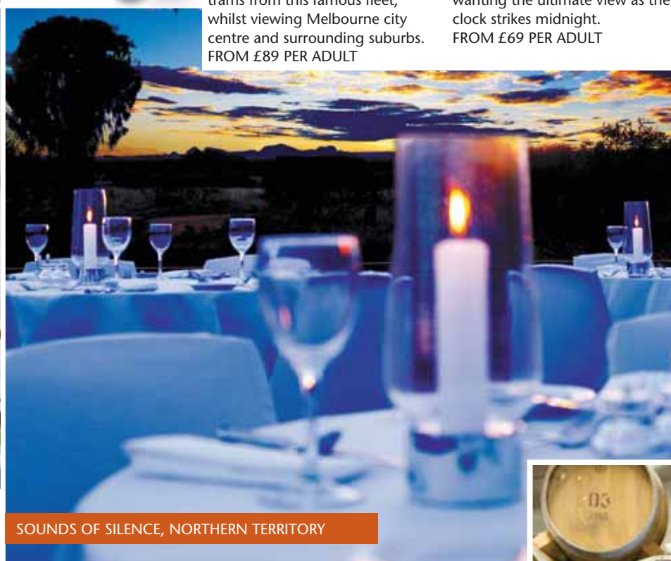
SOUNDS OF SILENCE, NORTHERN TERRITORY

17 Hunter Valley - Drive three hours north from Sydney and you'll arrive at the Hunter Valley wine region, home to numerous famous vineyards along with the Blue Tongue brewery at the Hunter Resort.