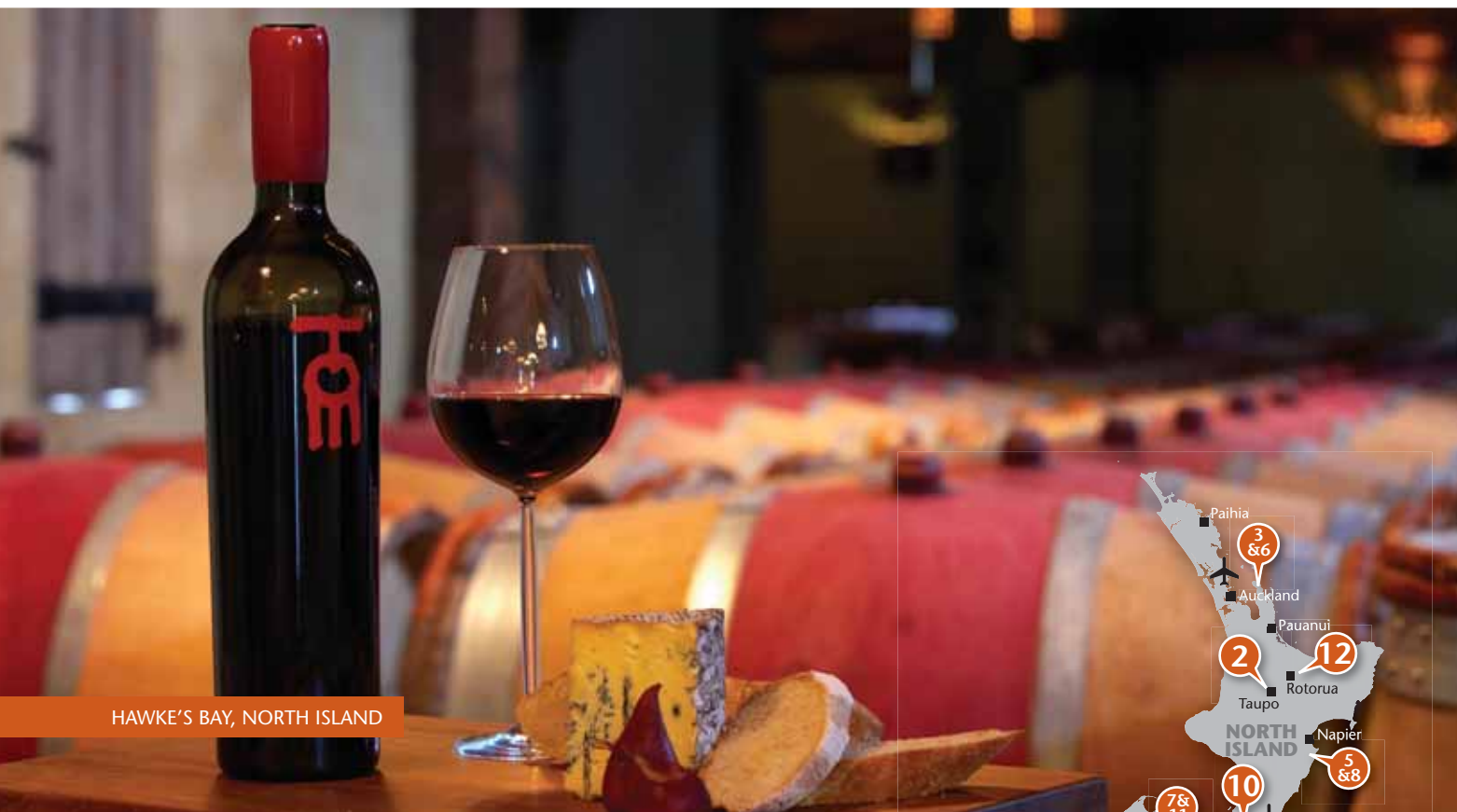
HAWKE'S BAY, NORTH ISLAND