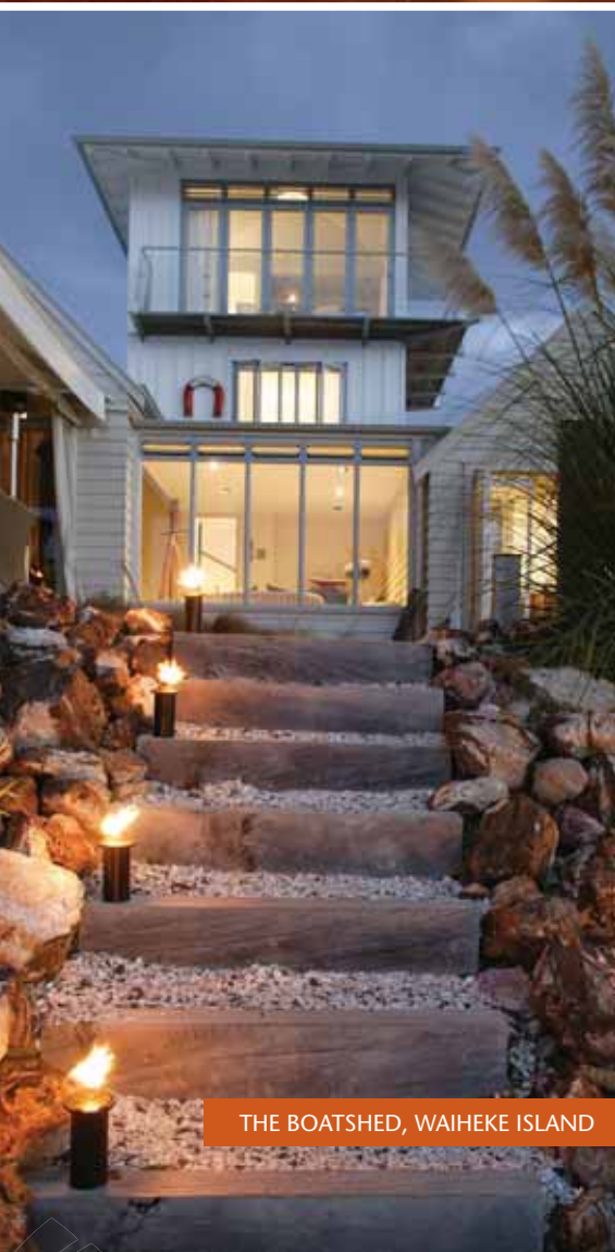
THE BOATSHED, WAIHEKE ISLAND