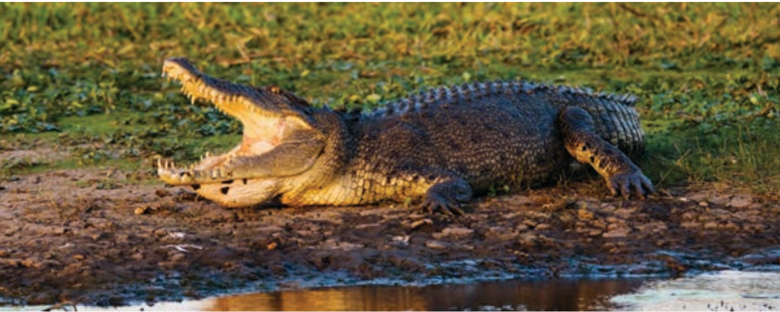
Get up close to the saltwater crocodiles of Kakadu National Park