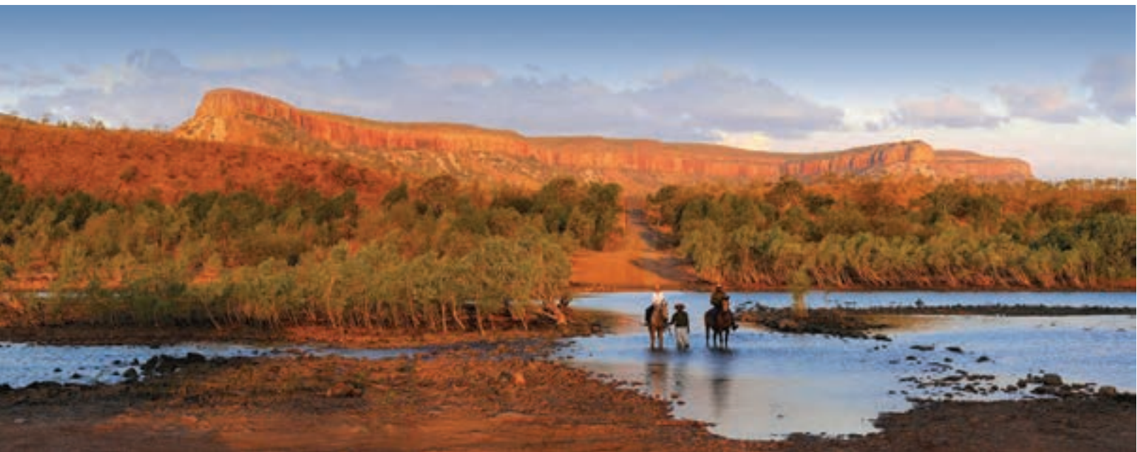
See the beautiful landscapes of the Cockburn Range as the backdrop to the iconic Gibb River Road