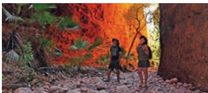
Discover spectacular Echidna Chasm in Purnululu National Park

EARLY BOOKING OFFER SAVE UP TO £550 PER COUPLE Please enquire for details