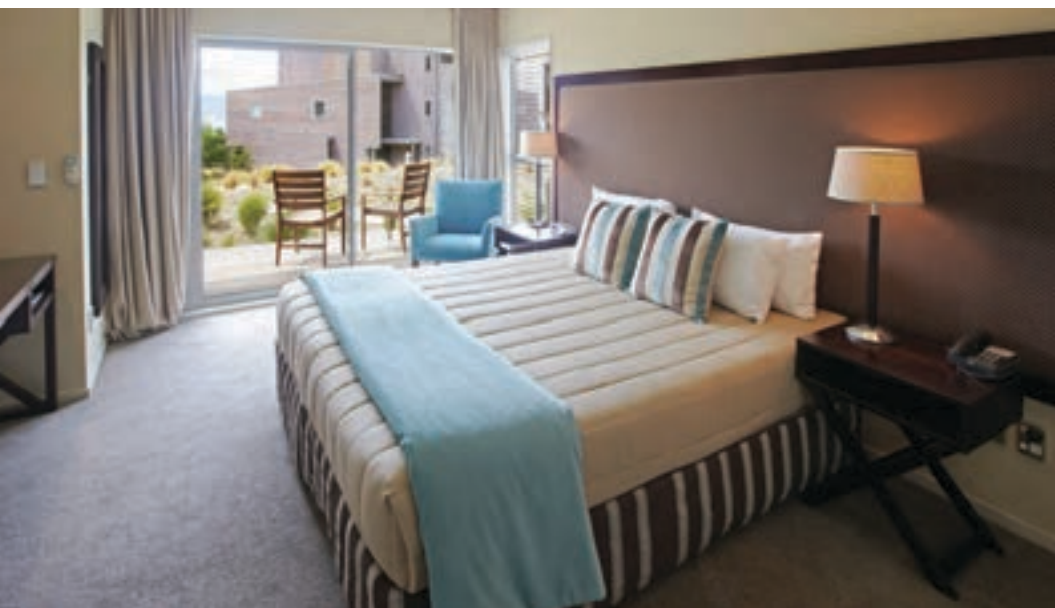
Enjoy modern comforts at Peppers Bluewater Resort

Stay in spacious and comfortable rooms at the Copthorne Hotel & Apartments Queenstown Lakeview with vistas of Lake Wakatipu. Located a short stroll from Queenstown's centre, you'll be able to enjoy everything this resort town has to offer.