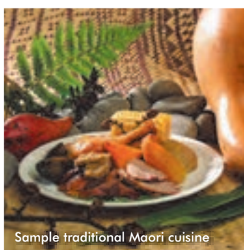
Sample traditional Maori cuisine