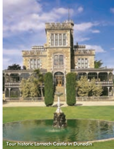
Tour historic Larnach Castle in Dunedin