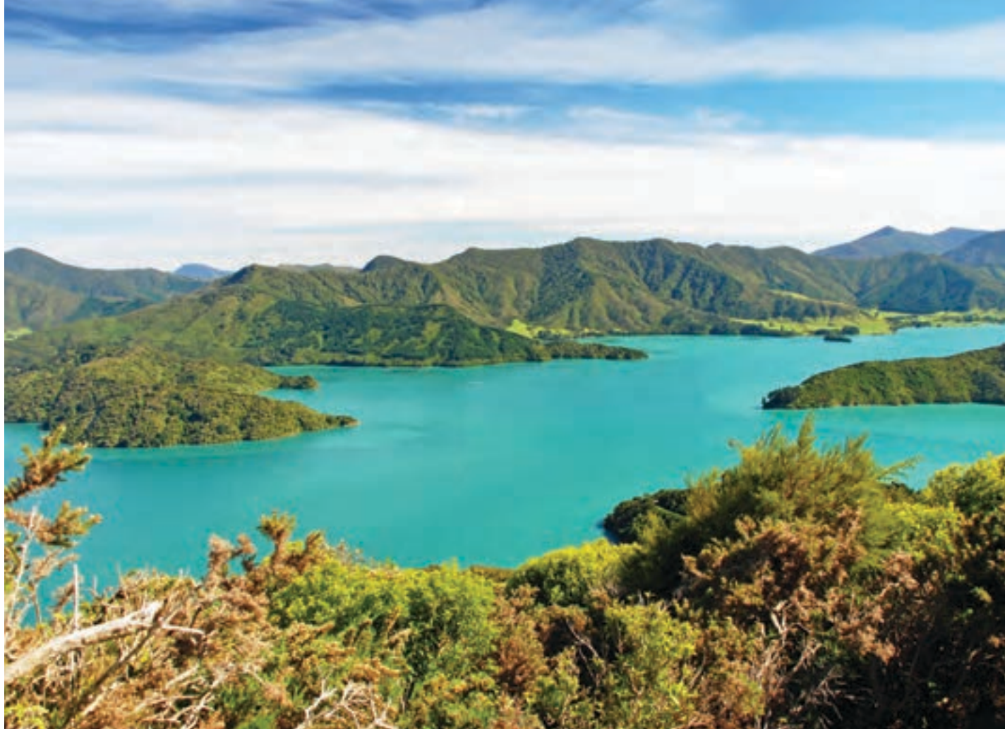
Cruise through the azure waters of Marlborough Sounds aboard the Interislander Ferry