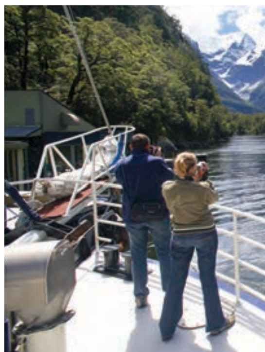
Cruise breathtaking Milford Sound