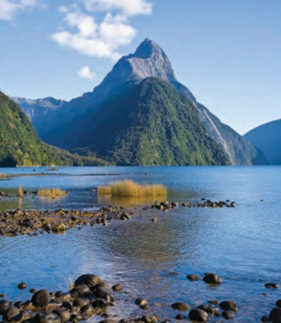
Milford Sound's spectacular scenery is truly unforgettable