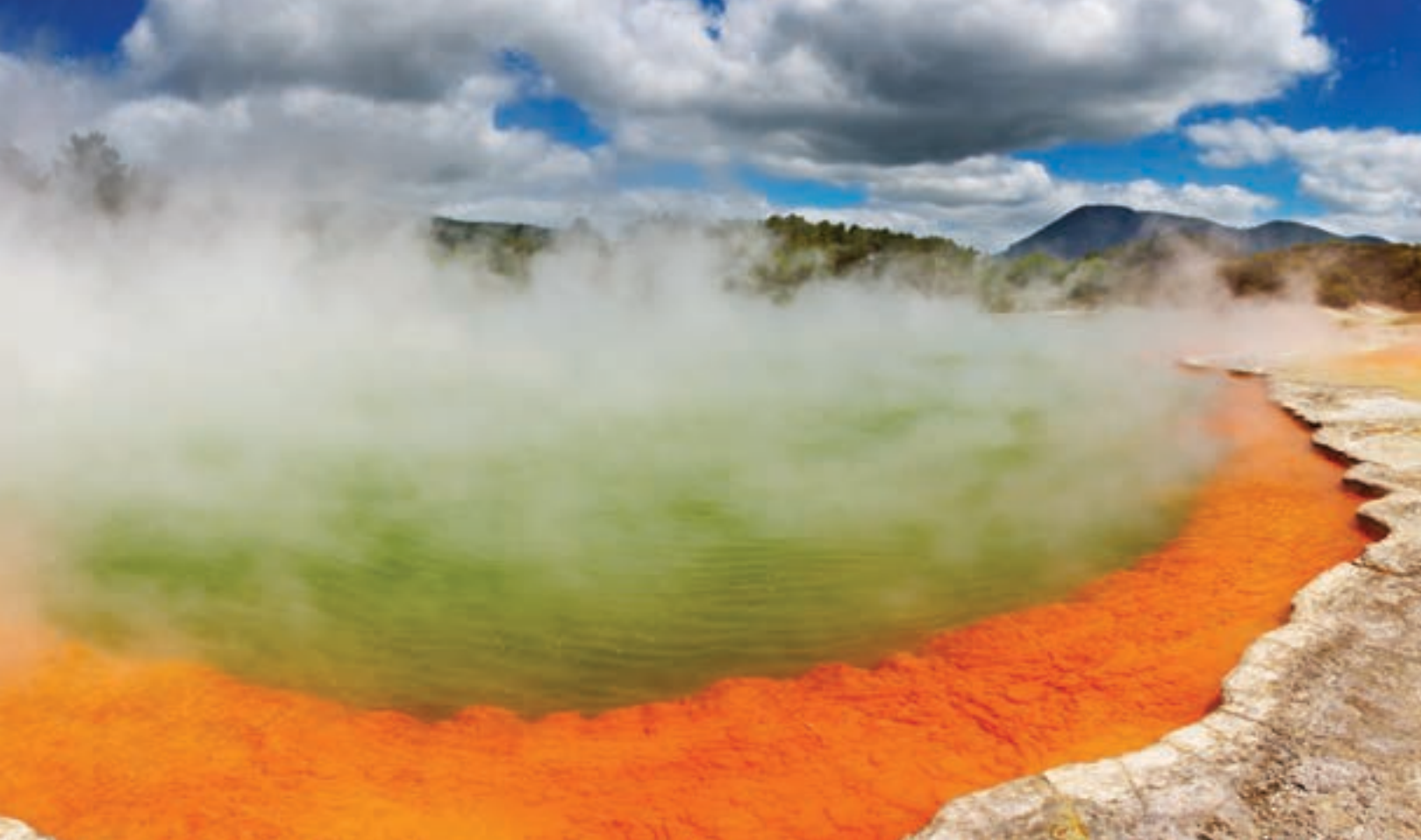
Be spellbound by Rotorua's geothermal wonders

Day 1. Arrive Auckland. Be met on arrival into Auckland and transferred to your hotel, which is centrally located in the beautiful harbourside city of Auckland, 'The City of Sails'. Stay: Copthorne Hotel Auckland City.