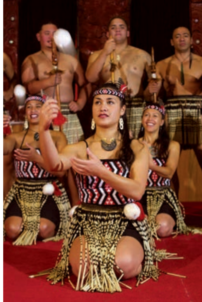
Experience the rich cultural heritage of the Maori people in Rotorua

★ Day 12. Queenstown, Fiordland National Park, Te Anau. Today, follow The Remarkables mountain range and Lake Wakatipu to Fiordland National Park. Journey along the Milford Road, thought to be one of the world's best alpine drives, to Milford Sound. Like a Local – cruise the full length of Milford Sound, a magnificent fiord with views of cascading waterfalls, dense rainforest, sheer cliffs and the surrounding mountains of this World Heritage-listed area. Afterwards, make your way to your hotel and enjoy dinner with your fellow travellers. Stay: Kingsgate Hotel Te Anau. BD