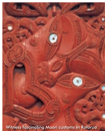
Witness fascinating Maori customs in Rotorua