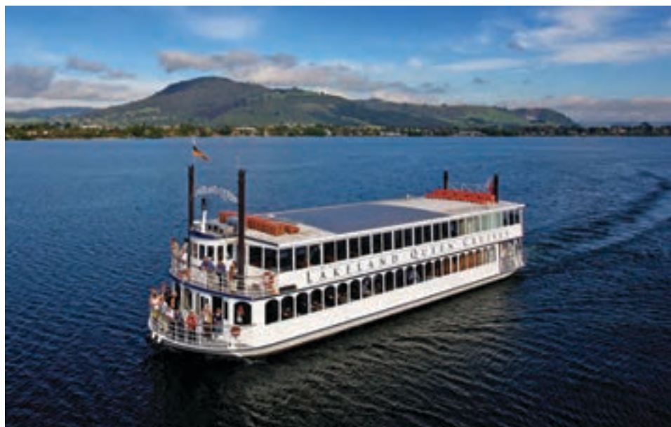
Step aboard the Lakeland Queen for a spectacular breakfast cruise on Lake Rotorua

The Rakinui Restaurant at Peppers Bluewater Resort is known for its excellent food showcasing the Mackenzie Country's finest produce, including free-range pork and venison farmed at nearby estates; renowned High Country Salmon; and organic free-range eggs. As your Farewell Dinner, enjoy a three-course meal that captures the essence of this fertile land. This is a quintessential New Zealand dining experience.