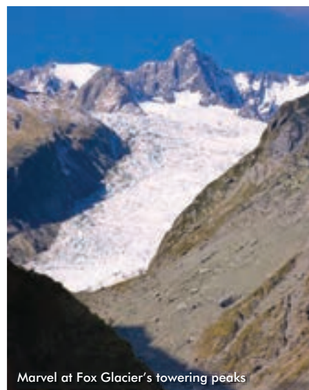
Marvel at Fox Glacier's towering peaks