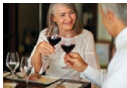
Perhaps sample New Zealand's world-class wines