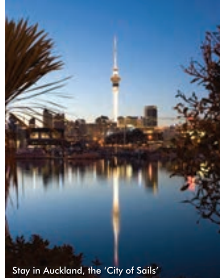
Stay in Auckland, the 'City of Sails'

Day 8. Depart Wellington. Your wonderful New Zealand journey comes to an end following breakfast this morning as you transfer to the airport for your onward flight. B