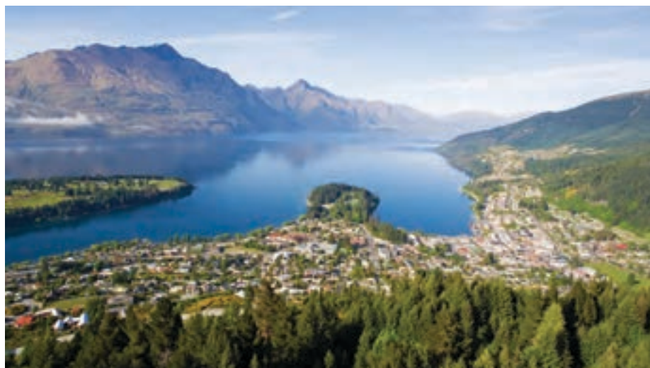
Enjoy time to explore Queenstown's stunning surrounds

Why not extend your adventure and explore Australia first? Escorted by our expert Travelmarvel Tour Directors, you'll visit the highlights and hidden gems across Australia & New Zealand over 36 days. Take advantage of our seamless connections and see pages 68 & 69 for itinerary details and pricing.