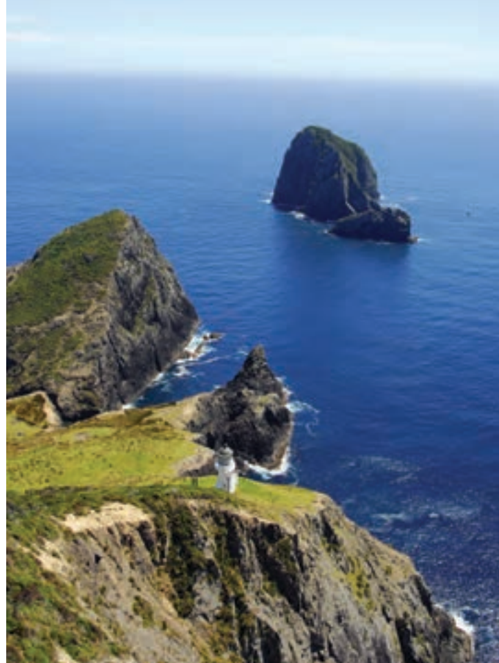
While in the Bay of Islands, cruise to Cape Brett and the famous Hole in the Rock

★ Day 6. Rotorua. Rotorua captures the essence of New Zealand with its geothermal geysers, fascinating Maori culture and rich heritage. The city is positioned on The Pacific Rim of Fire, and is therefore one of the world's most active geothermal areas. A Taste of Rotorua – for an extraordinary start to your day, begin with a buffet breakfast aboard the Lakeland Queen as you cruise over the still blue waters of Lake Rotorua. Your sightseeing continues with a visit to one of New Zealand's best-loved attractions, the Agrodome, with its entertaining sheep shearing demonstration, dog trials and animal nursery. Later, perhaps enjoy an optional helicopter flight for views over the active White Island volcano (own expense). Alternatively, experience life on the land with a special Country Homestay, where you'll enjoy warm hospitality, home-cooked meals and gain a real insight into rural New Zealand life (own expense – must be pre-booked). FB