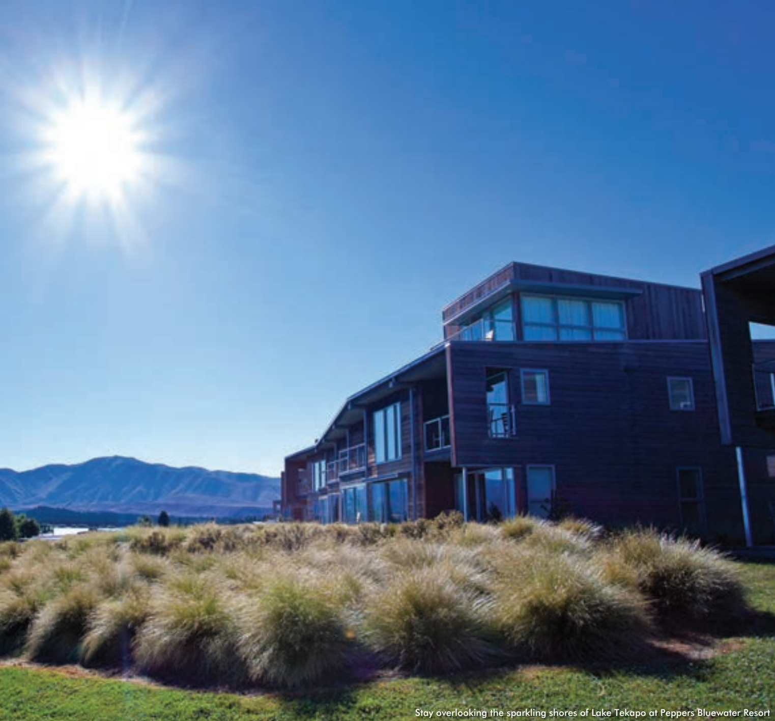
Stay overlooking the sparkling shores of Lake Tekapo at Peppers Bluewater Resort