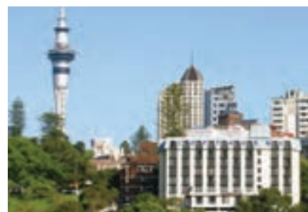
Copthorne Hotel Auckland City