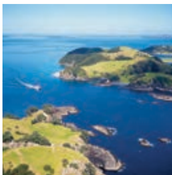
Set off on a cruise to Cape Brett