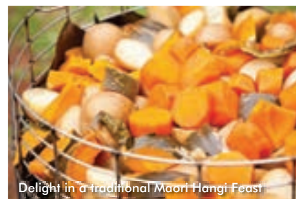
Delight in a traditional Maori Hangi Feast